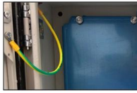
Grounding screw More aesthetically pleasing and safer